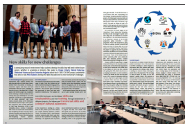
EU Research Autumn 2022 https://doi.org/10.56181/EBNW8618